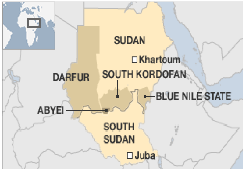
Figure 4. Geographic Locations of Three contested Areas Source: BBC News Africa, “Sudan Army seizes rebel stronghold in Blue Nile State,” http://www.bbc.co.uk/news/world/africa-15582526 (3 November 2011).

As shown on the map, Blue Nile State lies in the Southeast of Sudan, bordering Ethiopia in the east and South Sudan in the northeast. While Southern Kordfan lies in central Sudan, it strategically borders three states: Upper Nile, Unity and Bahr El Ghazal. It is important to note that Southern Kordfan also borders Abyei. In order to put the conflicts dynamics in these regions into perspective, it is important to pose this question: what is the significance of these regions for South Sudan? Both states have not only demonstrated great attachments to South Sudan, but they share a lot in common with people in the new country. There are several factors that created this reality. They range from historical, racial, cultural, and linguistically, but more fundamentally military and political marriages that existed and developed between South Sudan and the two regions. During the two decades of civil war, people from these regions allied and fought alongside the SPLM/A against the regimes in Khartoum. But when the Comprehensive