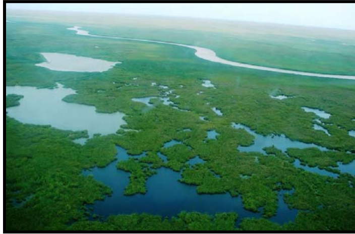
Figure 3. Freshwater systems in the Sudd, South Sudan

the south, reaching to the Sobat confluence in the north, and westward along Bahr El Ghazal. 142